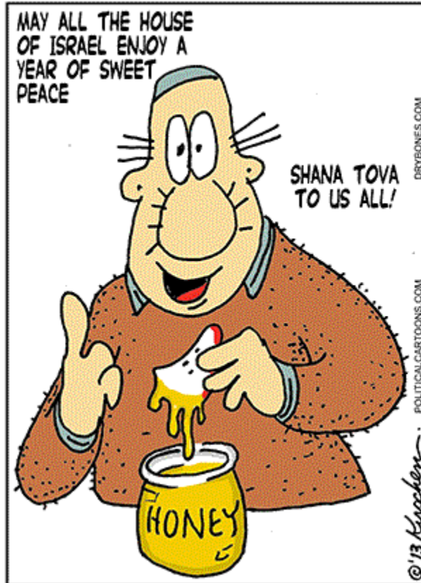
All Dry bones cartoons printed with permission of Yaakov Kirschen